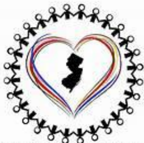
North Jersey Interfaith Cares

St. Timothy Lutheran Church will be working with NJIC – New Jersey Interfaith Cares to sponsor a refugee family who will be resettled in our area. An extensive list of household items to establish a home is available through the church office if you would like to help. Heart 'n Hands Mission is pleased to be helping this family of four with clothing, household goods and personal care items as they create their new home in New Jersey.